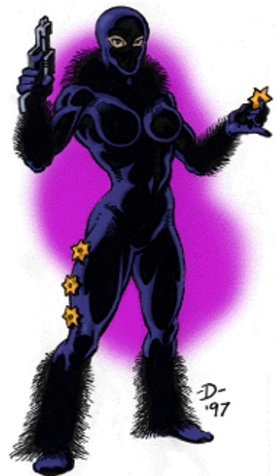
Artwork by Jeff Dee. Used with permission.

Typical characteristics are 15 to 17. Typical level 6 and higher. Martial Arts training grants +2 “to hit” and +1d6 damage with all HTH combat (armed or unarmed), and -2 to be hit by any attack while conscious and mobile. They also have Heightened Expertise (all attacks), Heightened Attack (all attacks) and Heightened Senses (2× normal Detection rolls). Typical Equipment: Bulletproof vest, HTH weapon of choice, throwing stars, energy pistol.